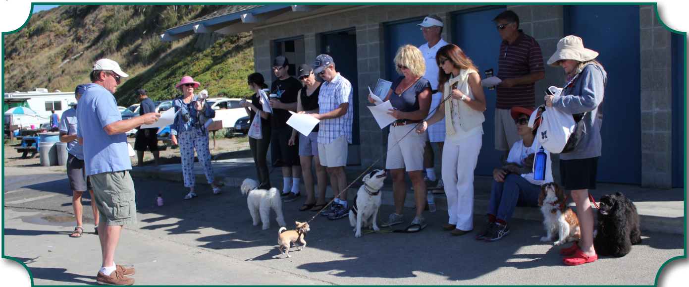
Above: Aptos History Museum members prepare for their dog walk with history!