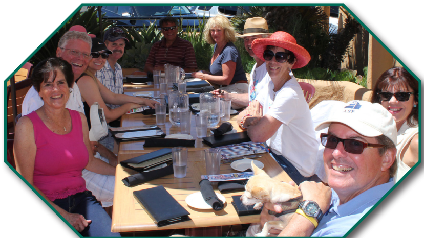
Above: Enjoying a nice lunch after some dog walking and historical facts at Café Rio in Rio Del Mar.