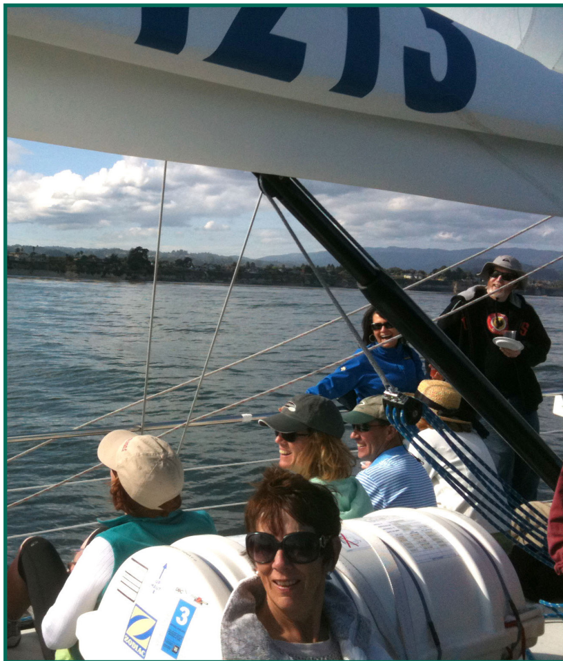
Above: Sailing aboard the Chardonnay II.