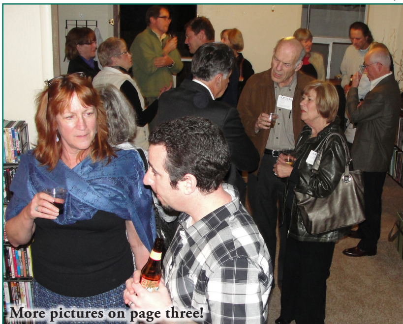
More pictures on page three!