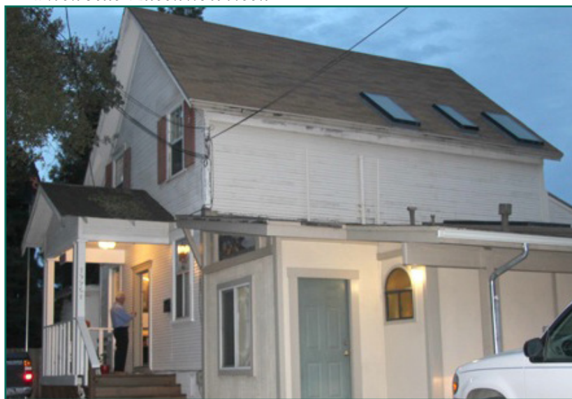
Above: The Arano store/house built in 1867 as it looks today.