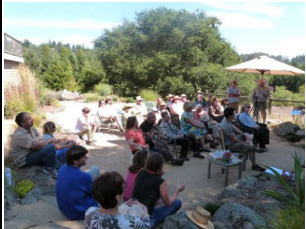
Above: Attendees of the Day Valley history event take in the fascinating past.